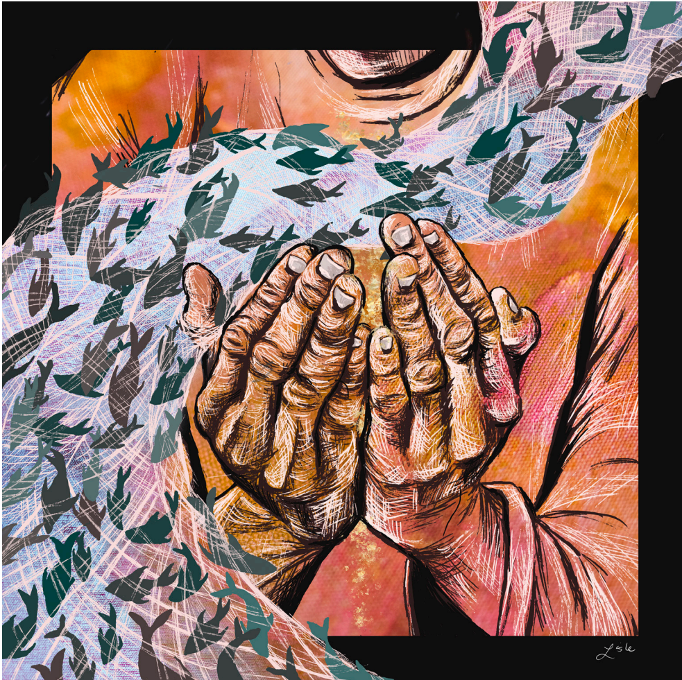
River of Grace by Lisle Gwynn Garrity, Acrylic painting on canvas with digital drawing