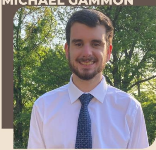
Graduated from the University of Louisville with a Bachelor of Science in Communications.