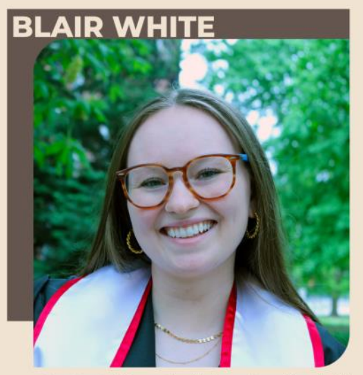
Graduated from the University of Louisville with a Bachelor of Science in Nursing