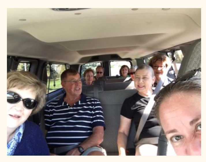
"A moment lasts all of a second, but the memory lives on forever."