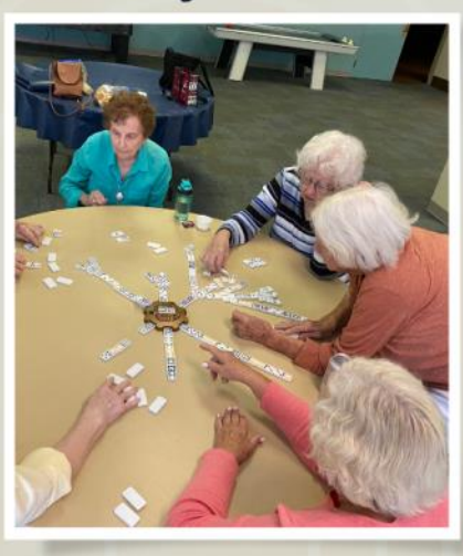
11:00 AM | September 13 and 27 Bring a lunch/snack for some fellowship and fun