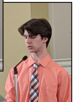
Youth leading in worship