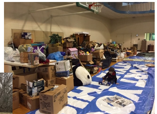
Leftovers for Wayside!