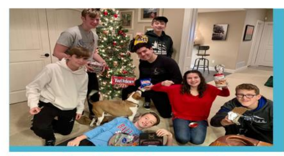
Youth Christmas Party