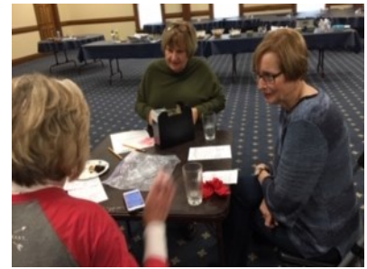
All are welcome