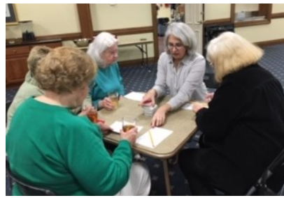
Game Day November 30