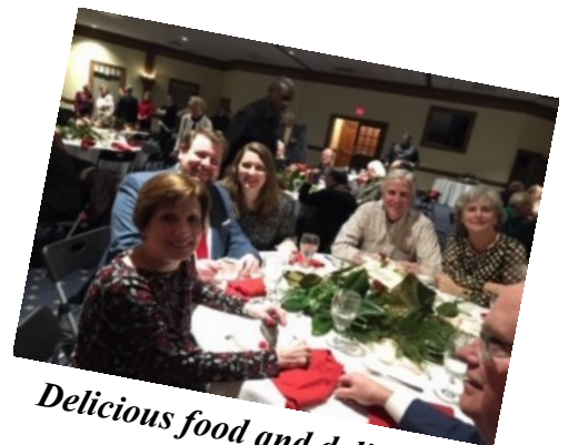
Delicious food and delightful conversation