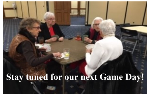
Stay tuned for our next Game Day!