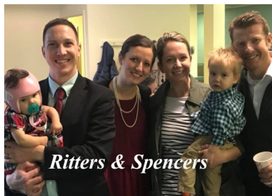
Ritters & Spencers