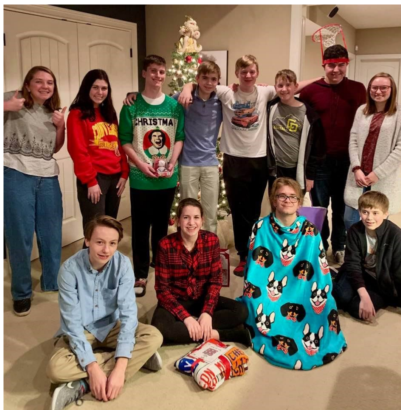
Youth fun at the Annual Christmas Party!

*Childcare provided for children birth through 5th grade in the Family Life Center.