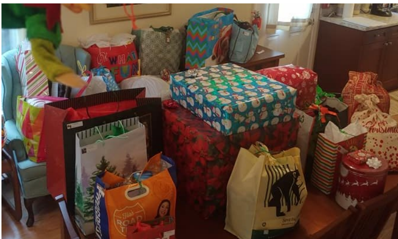
Gifts at Choice's Inc. and food delivery

Thank you to everyone who donated food, angel tree gifts, and warm weather gear to all our Mission Projects this Christmas!