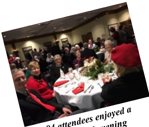
94 attendees enjoyed a wonderful evening