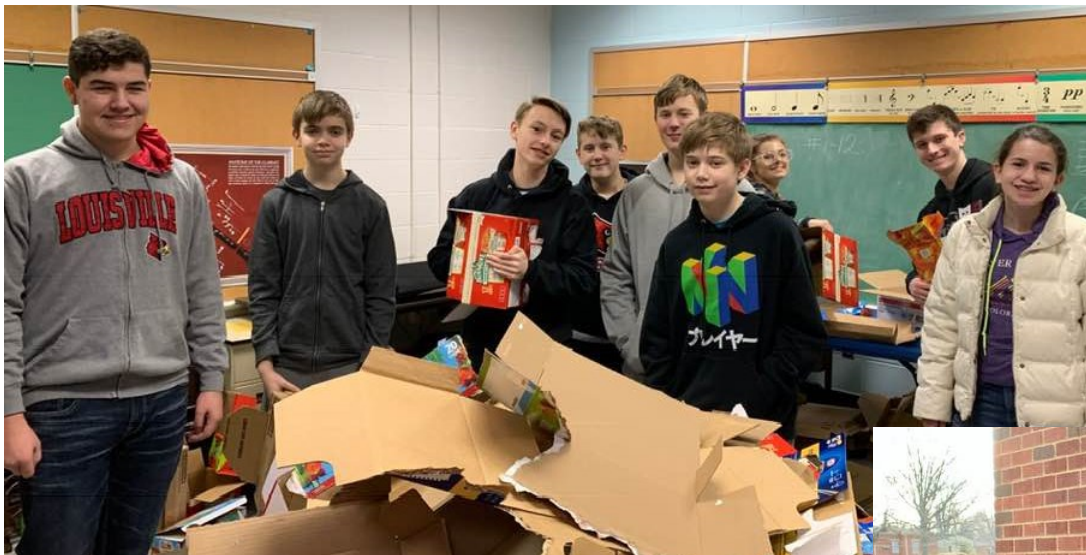
Breaking down food boxes at Cochran Elementary

Thank you to everyone who donated food, angel tree gifts, and warm weather gear to all our Mission Projects this Christmas!